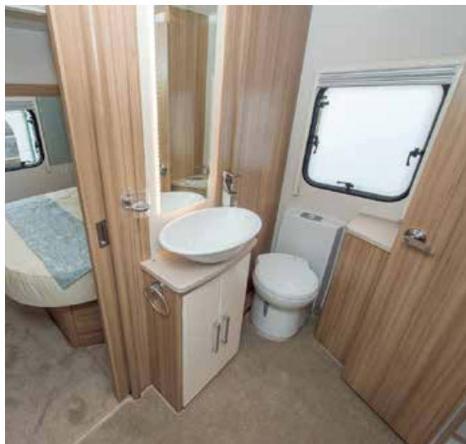
The washroom has one entrance to the bedroom, which creates more floor space. The specification includes a handbasin, toilet and mirror