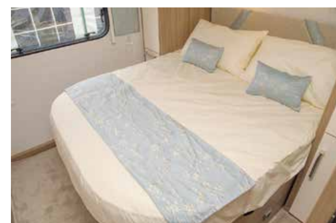
The island bed is a breeze to retract in the morning and extend for bedtime using Lunar's 'easy action' day/night mode

than by a family. The lounge is a little on the short side; four adults will find it a tad cosy, though not a tight squeeze. We reckon an L-shaped lounge would work better here. Perhaps that could be offered as an option for 2017.