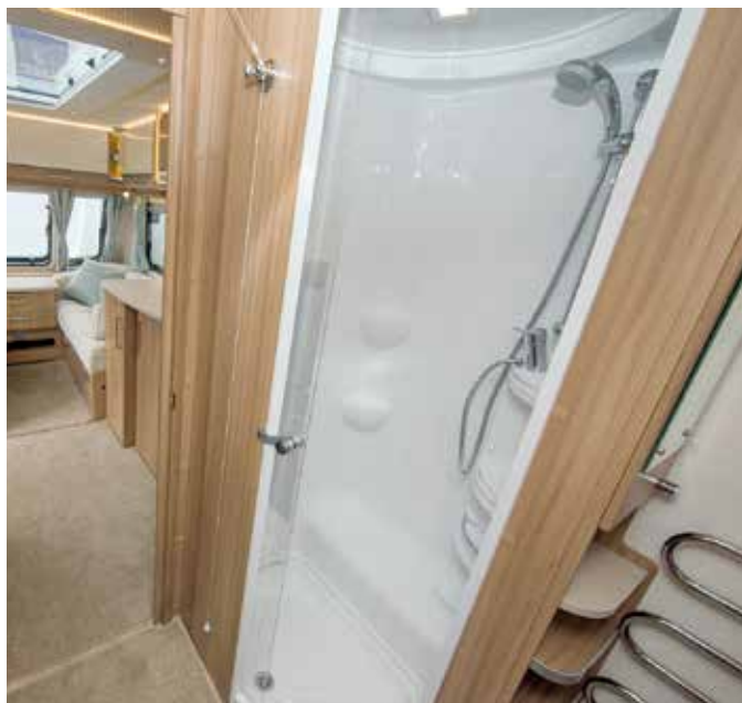
The separate shower cubicle is close to domestic size, while nearby on the offside wall are a mirrored cupboard and a heated towel rail