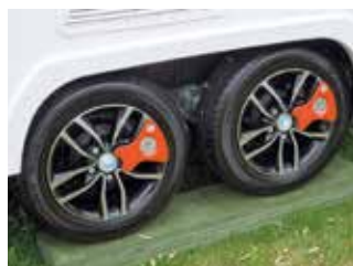
The grabhandles have LED courtesy lights behind them to make finding them at night simple RIGHT The alloy wheels get Al-Ko Secure locks

As you enter the bedroom, you'll see a mirror on the left that folds out to reveal extra storage – a welcome touch. Good natural and artificial lighting, and plenty of ventilation round out the room.