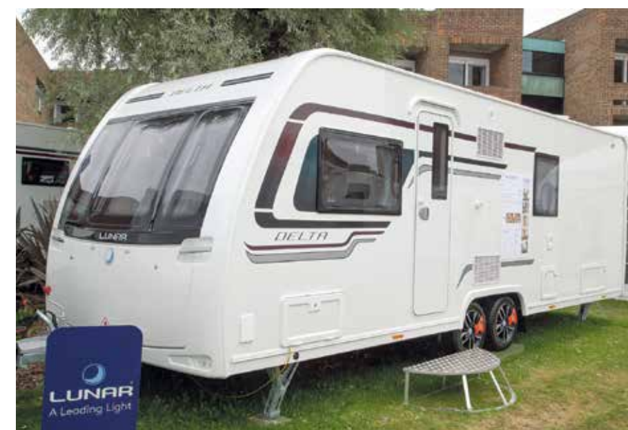
CLOCKWISE FROM TOP LEFT LEDs are used throughout the Delta to provide a wide variety of lighting options. The attractive front panel, decals and alloys set it apart from the rest of the Lunar line-up. The digital control panel is directly above the glazed, one-piece entrance door