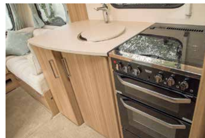
The galley has generous amounts of storage and workspace, as well as a separate oven and grill, three gas burners and an electric hotplate