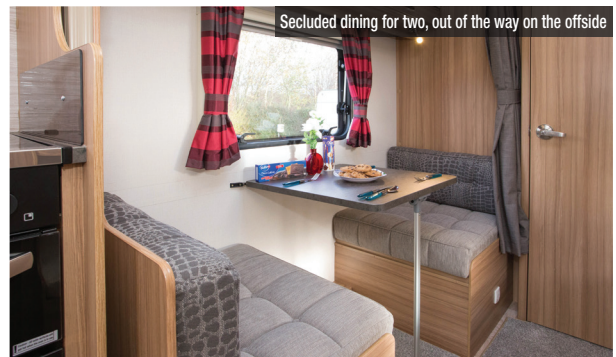
Secluded dining for two, out of the way on the offside