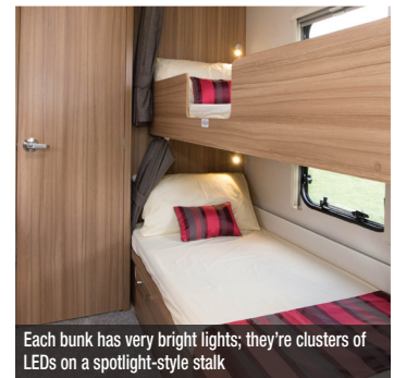
Each bunk has very bright lights; they're clusters of LEDs on a spotlight-style stalk