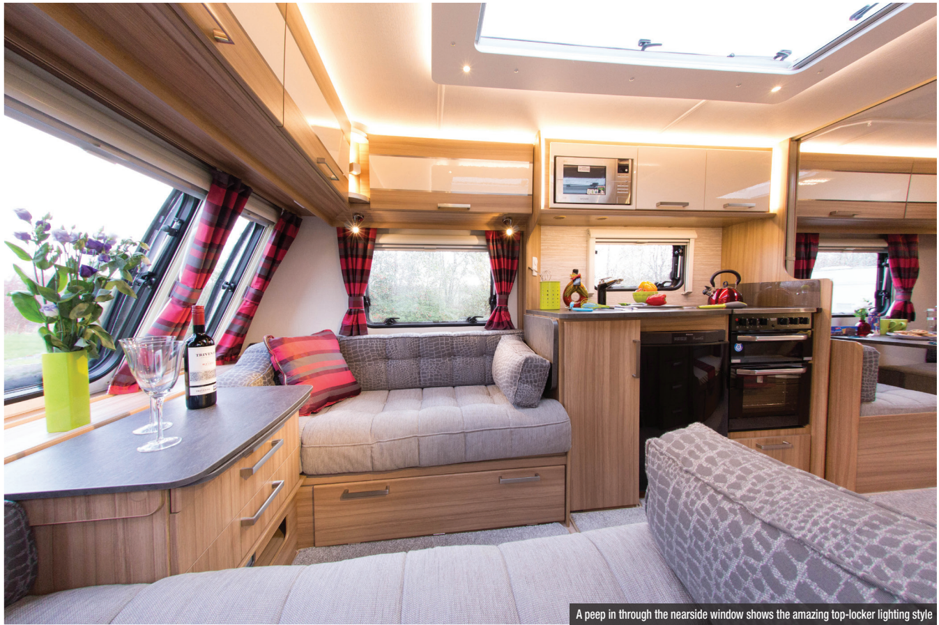
A peep in through the nearside window shows the amazing top-locker lighting style