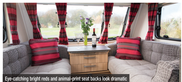
Eye-catching bright reds and animal-print seat backs look dramatic