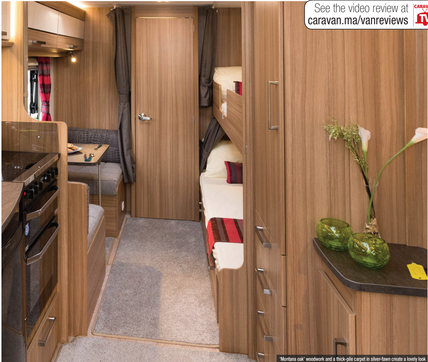
'Montana oak' woodwork and a thick-pile carpet in silver-fawn create a lovely look