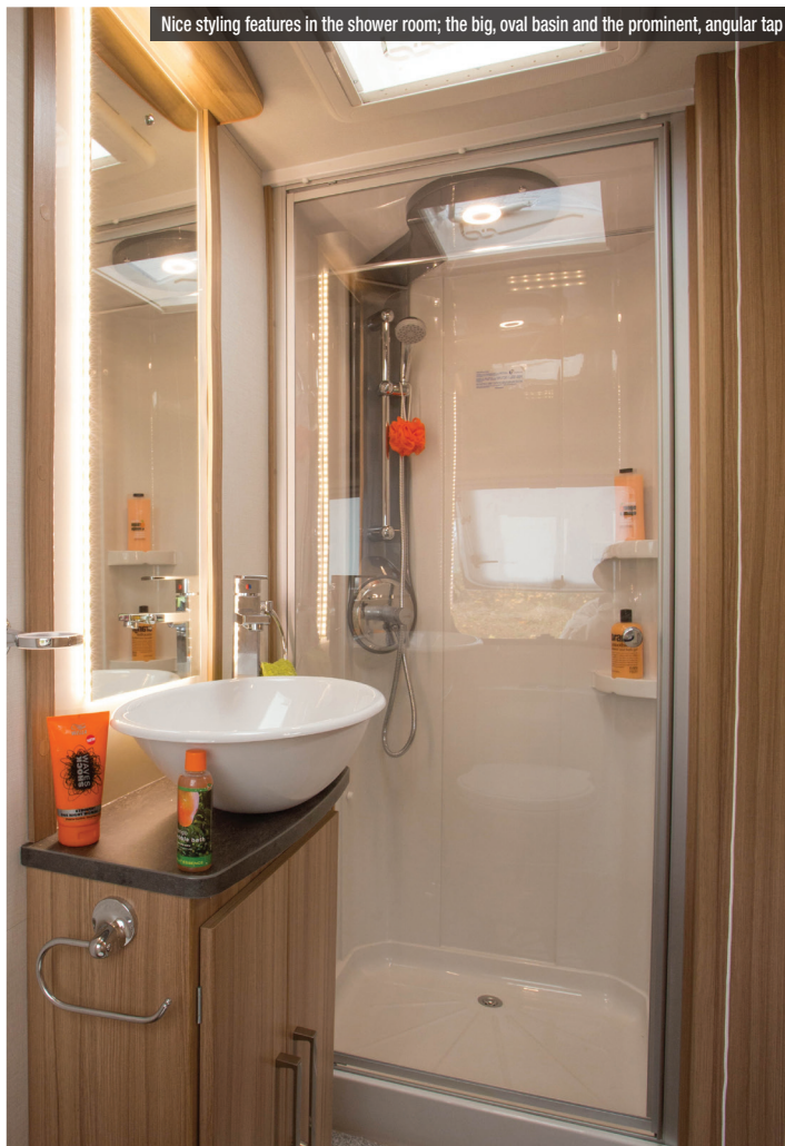
Nice styling features in the shower room; the big, oval basin and the prominent, angular tap