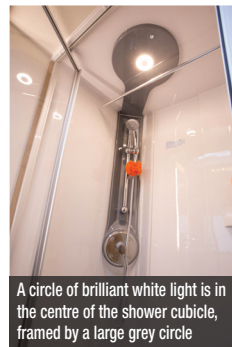
A circle of brilliant white light is in the centre of the shower cubicle, framed by a large grey circle