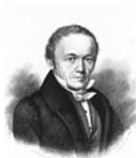
Cajetan - saint who founded the pawnshops

Bit short of cash for your holiday this year? Cajetan (1480 – 1547) should be the patron saint of anyone who needs some extra money – right now. For it was he who founded the Monts de Piete – the pawnshops – in the 16 th century. They were first designed to help people through a lean time, not exploit them.